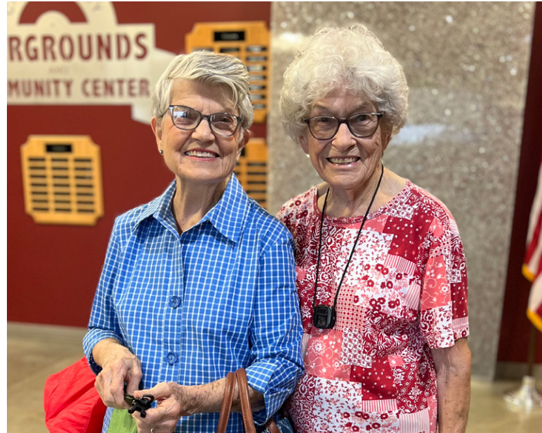
Two members attend District Meeting in Vinita

Members may register to vote/participate at their District Meetings from 6 p.m. to 7 p.m. District meeting starts at 7 p.m., but those in line prior to 7 p.m. will be given a card ensuring their opportunity to register. All district meetings start at 7 p.m., or as soon as is practical thereafter.