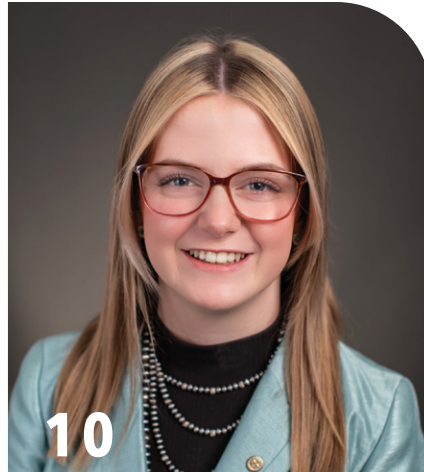
YOUTH TOUR WINNERS

Search the pages of Northeast Connection for a 6-digit account number with an asterisk on each side. For example: *XXXXXX*. Compare it to your account number, which appears on your monthly electric bill. If they match, contact the cooperative at 918.256.6405, by August 1, 2024, to claim a $100 credit on your electric account.