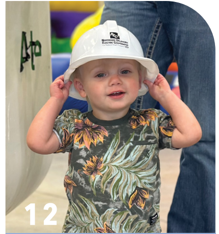
SPRING EVENTS WRAP-UP