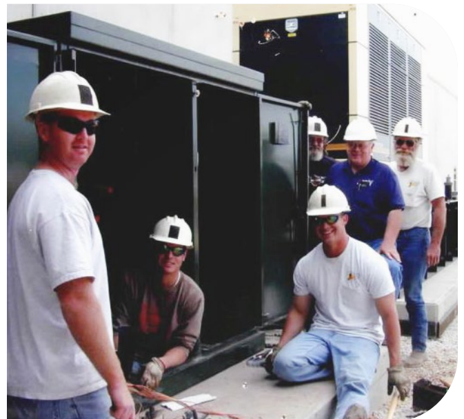
Gibe and crew build service to Lowe's in Grove, 2003

I guess the more things change, the more they stay the same.