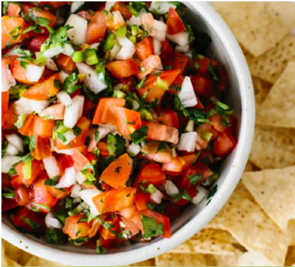
Quick, easy, and fresh!