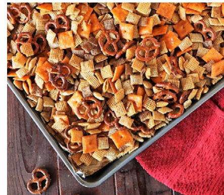
Bake time: 10 minutes

Step 3: Once cooled return mixture to large bowl and add M&Ms, stir to combine.