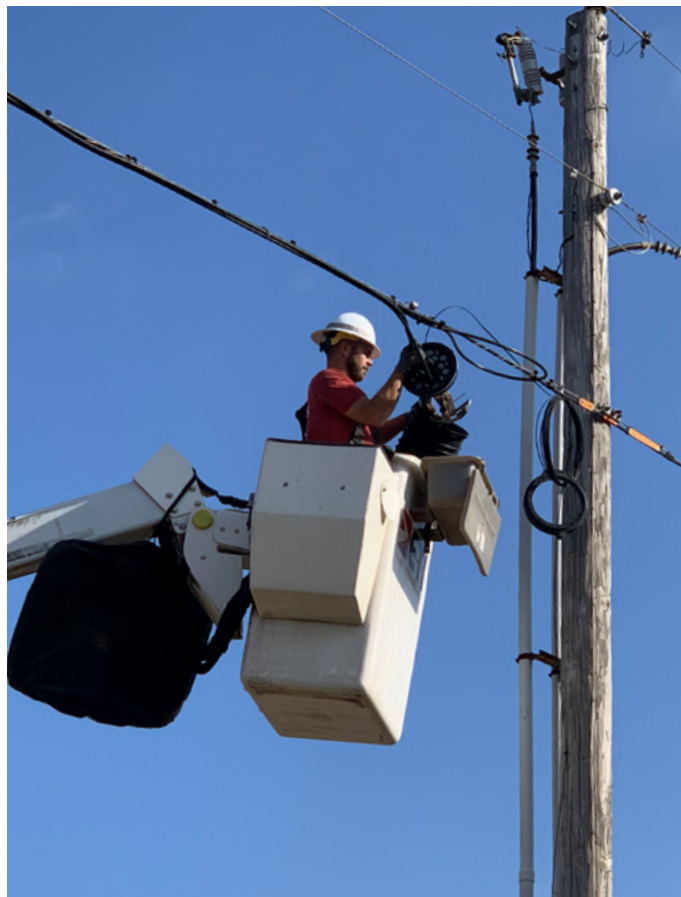
BOLT installer setting up new service.